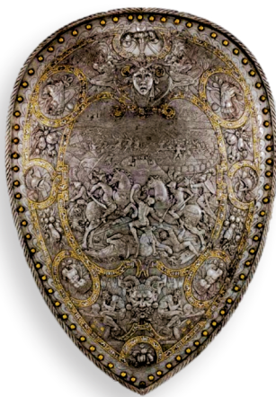
In copertina: Targa sbalzata e ageminata appartenuta a Enrico II, re di Francia, attribuita a Étienne Delaune, Jean Cousin il Vecchio e Baptiste Pellerin, Fontainebleau 1555 circa, New York, Metropolitan Museum of Art, inv. 34.85.